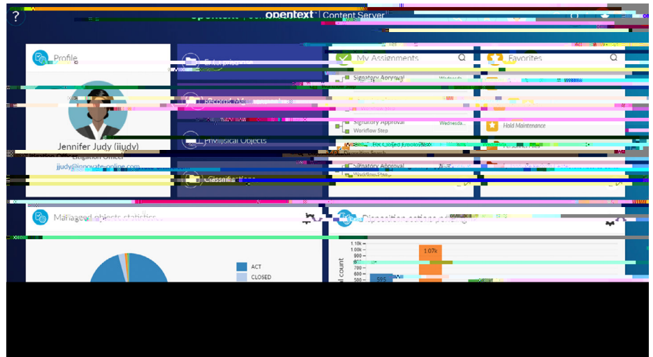
Visual role-based perspectives make it easier to manage Records Management, Physical Object and Security Clearance content

U.S. Food and Drug Administration (FDA) Part 11